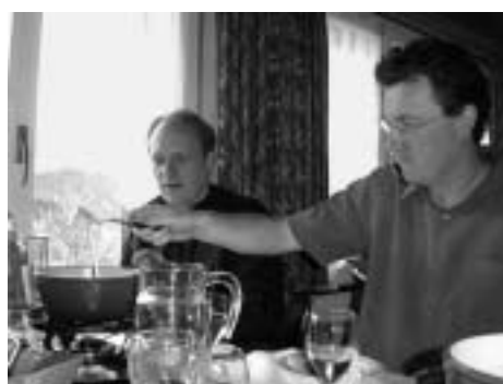
Tim Swager and David MacMillan tasting fondue