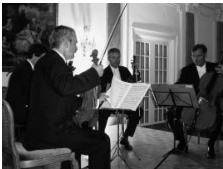
The Aura String Quartet