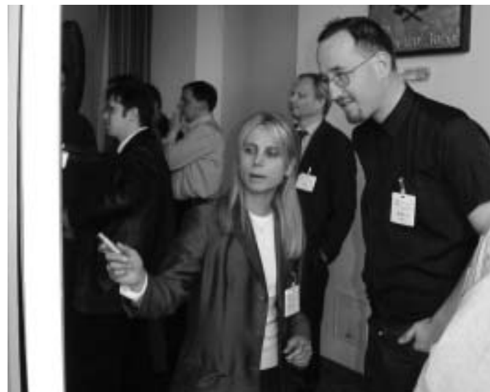
The relaxed poster session