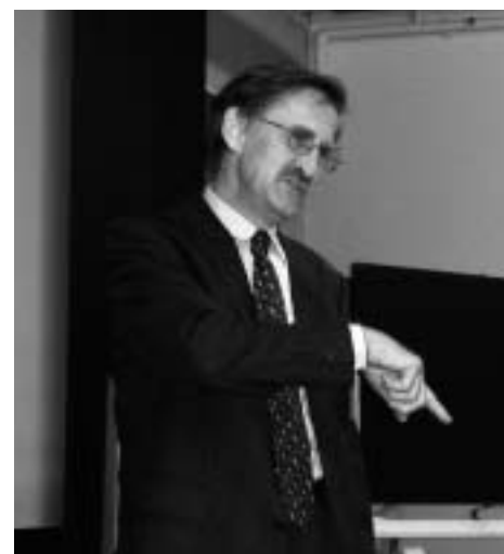
Manfred T. Reetz

The evening lecture belonged to the director of the Max-Planck Institute für Kohlenforschung, Manfred T. Reetz , who gave a fascinating lecture on 'Evolutionary and Combinatorial Methods in Enantioselective (Bio)Catalysis'. Starting off with the traditional transition metal catalysis of Rh-catalyzed hydrogenation using monodentate phosphites and phosphonites introduced by his group only recently, he presented a combinatorial approach leading to high enantioselectivity. Interestingly, as mechanistic evidence points to the fact that two ligands are coordinated to the Rh in the transition state, he observed that using heterodimers consistently gave higher ee than homodimers! This spectacular observation could be exploited by using small combinatorial libraries of mixing phosphites and phosphonites leading to unprecedented high ee values. In a second part of his talk, Reetz demonstrated that evolutionary methods can be used to tune the enantio-