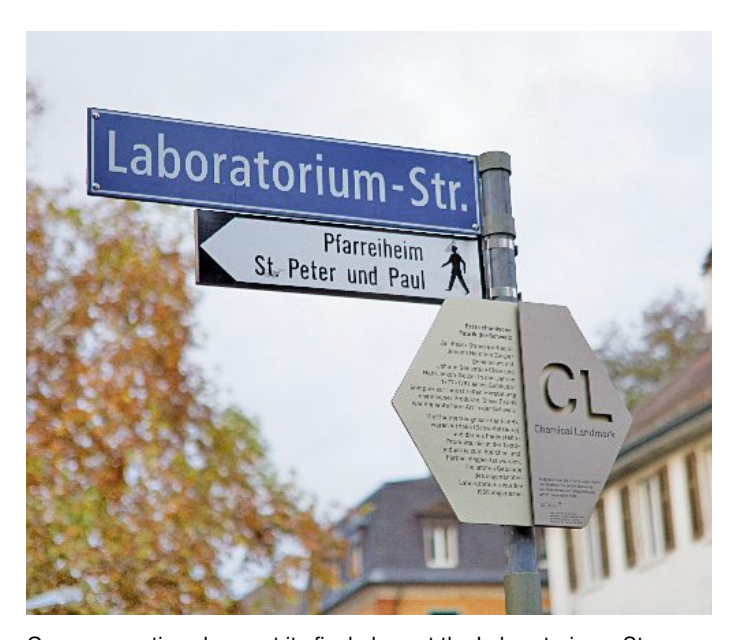
Commemorative plaque at its final place at the Laboratoriums-Strasse

More information about the 2009 'Chemcial Landmark' designation may be found at www.chemistry.scnat.ch/Chemical_Landmark_2009.