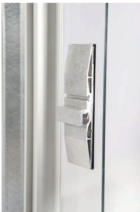
Fig. 5. Mounting pad bonded on the back of a glass model.