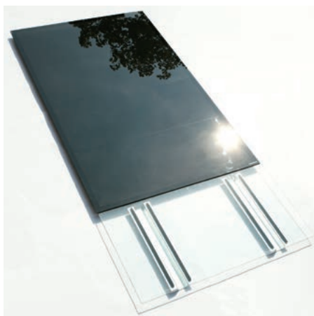
Fig. 3. Backrails for fixation.