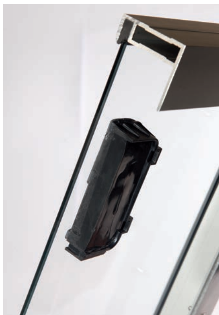
Fig. 1. Solar panel model showing a traditional frame construction.

Why does the solar industry need a frame around crystalline PV modules? Discarding the aluminum frame could save up to 5–7% of the material costs in the module and frameless modules offer a number of advantages to the module manufacturers, and their customers.