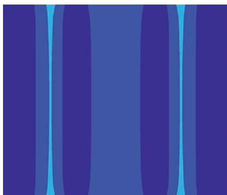
Fig. 4. Bonded backrails dissipate stresses along the bond line.