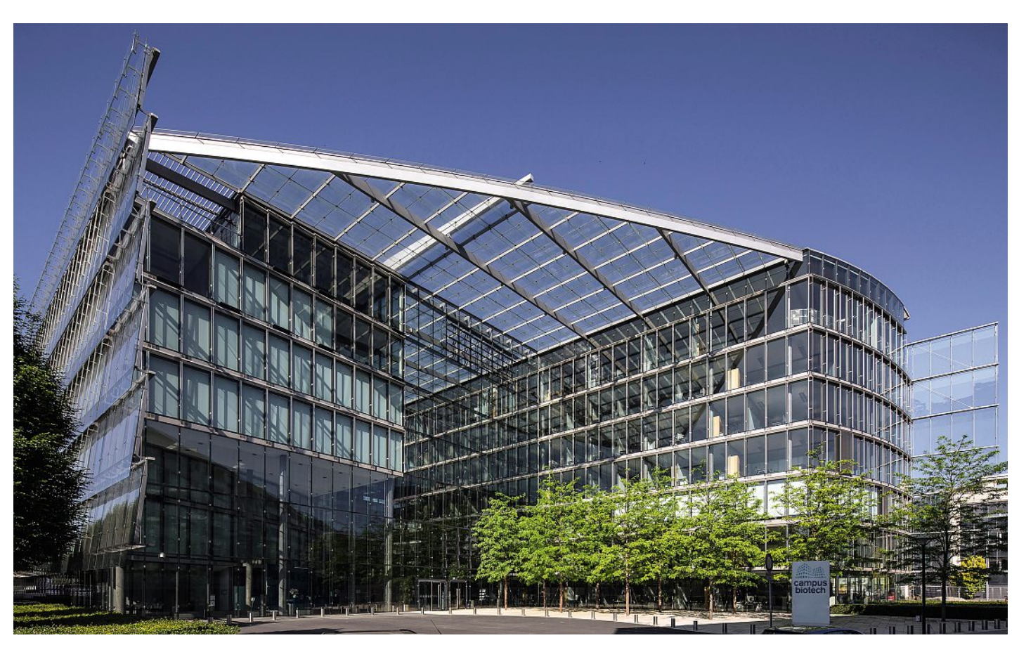
Campus Biotech is a new centre of excellence in biotechnology and life science research. It focuses on science and its translation into products that have an impact on society and the world. Campus Biotech is expected to generate a vast range of opportunities, bringing impetus and investment to this vital economic and scientific sector. The building that has housed the former Merck Serono headquarters, and which is now home to Campus Biotech, was conceived as not only a hub for science and research, but also a place for people to meet and a place to be enjoyed.