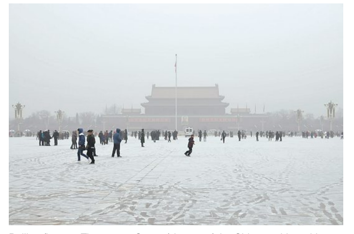
Beijing (here at Tiananmen Square) is one of the Chinese cities with severe air quality problems during haze events in winter.

During severe pollution episodes in January 2013, aerosols were collected on quartz filters in four major cities of China, i.e. Beijing, Xi'an, Shanghai and Guangzhou. Here, we show results from Beijing as one example. For a unique chemical analysis, several chromatographic and mass spectrometric techniques were combined. The two most important methods were a newly developed offline application of aerosol mass spectrometry, which identifies major aerosol components and their general emission processes, and measurement of the radioactive carbon isotope <sup>14</sup>C (radiocarbon) with accelerator mass spectrometry, which allows the distinction of emissions from fossil sources